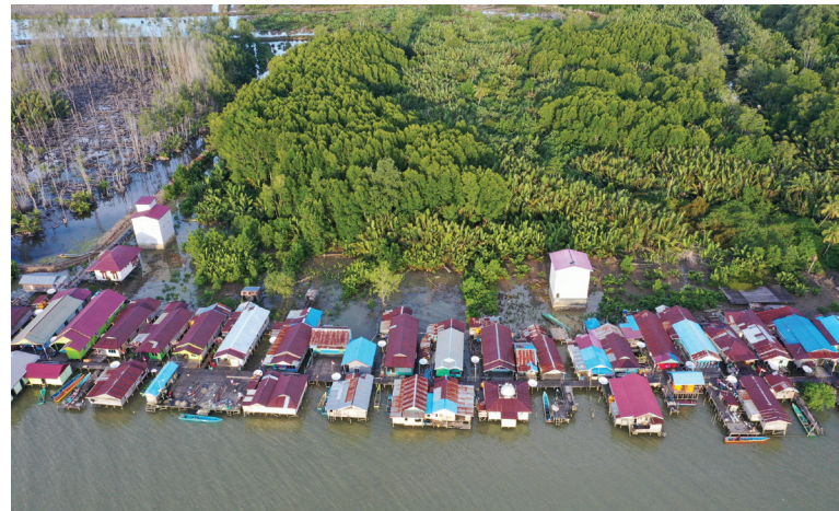
[Figure 1] Settlements in Tabalar Muara Village

Indonesia has NCS mitigation potential of 1.3 GtCO 2 e yr -1 (Novita et al., 2022), which is equivalent to about 6% of global NCS mitigation potential (Griscom et al., 2017) and 10% of NCS mitigation potential across the tropics (Griscom et al., 2020). About 3% of this potential comes from mangroves which can help carbon emission gaps to achieve the target of the Paris Climate Agreement of limiting global warming to below 2°C above the pre-industrial level. Our result showed that mangrove conversion and restoration could result in a mitigation potential equivalent to 8% of Indonesia's NDC target from the forestry sector.