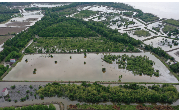
[Figure 2] Mangrove conversion to aquacultures

East Kalimantan has one of the largest shares of Indonesian mangroves, with a total area of about 157,802 ha. Within the past decade (2009-2019), ~13% of mangroves in East Kalimantan have been converted into other land uses. Aquacultures are the most prominent threats to mangroves deforestation and degradation, causing large carbon emissions that contribute to global climate change. Based on satellite imagery analysis in 2019, ~22% of the mangroves in East Kalimantan remains relatively intact (35,418 ha of primary mangrove forest). About half of these primary mangrove forest areas (16,263 ha) can be found in Berau. The rate of mangrove conversion in Berau is smaller than the average of East Kalimantan, with ~5% of the mangroves area converted into other land uses from 2009-2019. Nevertheless, mangroves in Berau face similar threats with aquaculture being the major driver for mangroves conversion.