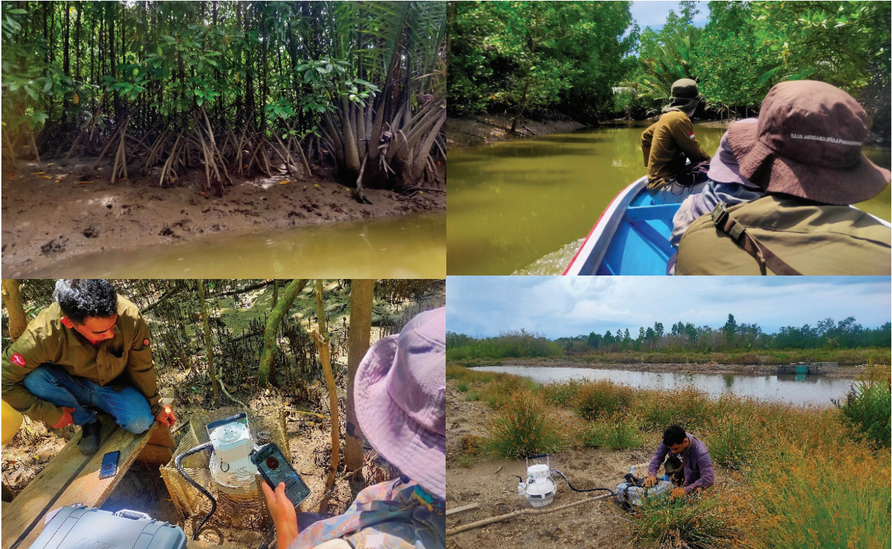
[Figure 4] GHG fluxes measurement in Tabalar Muara mangroves ecosystem

“Measuring GHG emissions from various land use management in the ecosystem is crucial to understand the impacts of mangrove conversion or restoration for climate change mitigation.”